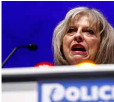
May the Force be with you !

our position as the world’s primate info-hub.’ ‘It’s all about building trust. Britain has had centuries of telling others how they should live. It just comes naturally to us, and people like to be spied on and told what to do.’ ‘One of the advantages of the cloud is that the information is all there. It just needs to be harvested responsibly and sorted into intelligible data that will stand up in whatever legal system you might choose to apply. It’s all done by machines anyway, so that there is no margin for human error or bipartisan, left-wing pettiness.” “And it’s totally innocuous, like the modern equivalent of an itemised phone bill , just a bit more detailed so that we can pinpoint issues like build-ups of Weapons of Mass Destruction and help to organise precision bombing raids in places as far afield as Fiji or New Zealand. While we are at it we can also ferret out paedophiles and religious fanatics and hand them over to the press for instant justice. As icing on the cake we can also nab those people who aren’t paying their TV Licences. It’s like a total Win-Win. I’ve always maintained that an enlightened British vision can supersede