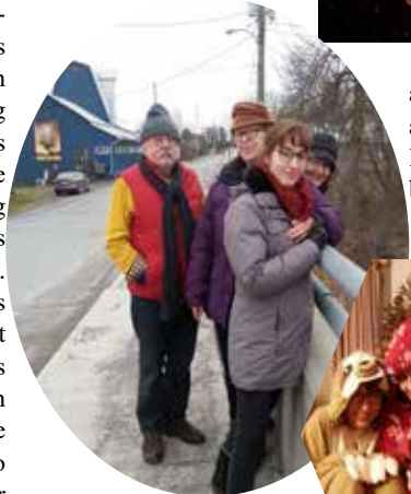
Take especial care on

and can be employed with a high resolution telephoto lens to distort the relationship between the subject and onrushing nemesis affording just that extra margin of safety, critical fractions of seconds, to step out of the path of doom.