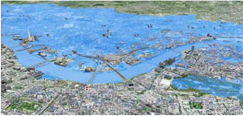
London's Lumley Bridge will provide a Green focal point as London adjusts to climate change realities