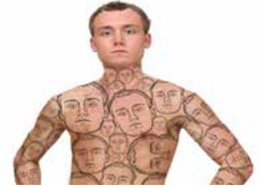
Demonstrating that you're a people person and real team player

Public Surveillance has taken another leap forward with the installation of c.c.t.v. cameras to monitor 24/7 all aspects of a student's life. Parents can subscribe to www.schooliflive.com sites which transmit images of their offspring and records their behaviour. School security trustees extol such programmes. "Anti-social behavior like queue jumping, illicit kissing, or thumping of mates can be targeted and eradicated quickly. With over 700 cameras in a typical schoolyard even minor infringements of human rights can be eradicated by groups of roving Social Workers. But the policy can also be applied to over zealous parents who are only too often carried away in directing the