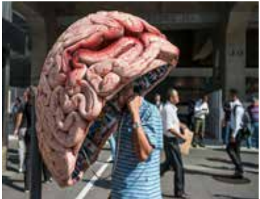
Calling home for advice

We're all into Self enhancement! Now you can grow your own new brain replete with little grey cells!