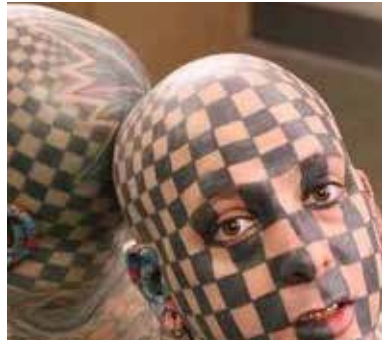
Odessa's very own checkers champ finds that a good tatt lends psychological advantages.

Today's sportingworld is all about brand definition. It's the advertising equivalent of drawing Go Faster Stripes on your Lambo. Everyone is competing to achieve the most memorable tatt.