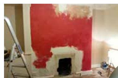
Migrants add colour and bring in a whole new cultural aesthetic

Louvre while on the way to a tropical evening at the Moulin-Rouge Sur Plage to enjoy the ever popular Ludwig van Beatles show. In