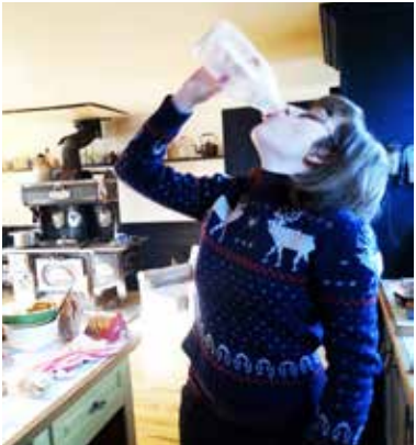
Downing lethal cocktails-a popular gambit