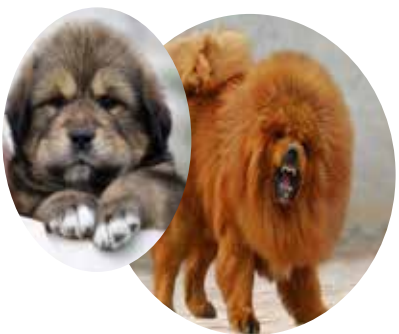
The Much Beloved Tibetan Mastiff