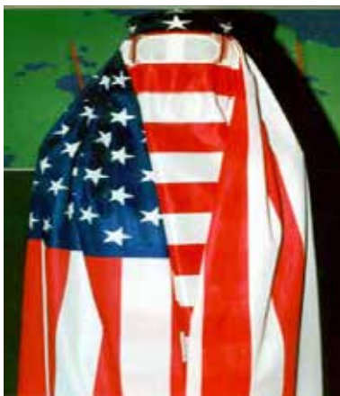
CCCOIN Proposed Campaign Burqa for Donald J Trump