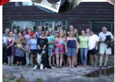
Cast in stone

Android Lloyd Webbot team explains the E-mpressario's visionary strategy, "Absolutely nothing will be left to chance. The story pulls together so many current obsessions that the plot is clearly a no brainer.