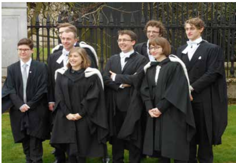
Or some opt for Burka Lite!

"Those days of being able to walk out with a refrigerator under your chador are long gone. Trained staff can pick these off every time as they trundle to the exit."