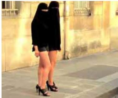
Some question the Trumpsters kit as leaving little to the imagination.

Both teams, are adopting the 'Put Up and Cover Up' game winning (and profitable) strategy enunciated by FIFA Chairman Sepp Blatter. They are looking forward to meeting the pay offs at the World Cup in Qatar in 2022. With temperatures expected to exceed 45 degrees C the game is already being promoted as a sizzler. While some have questioned the apparel stipulated by this conservative Gulf society, many footsie fans have welcomed a relief