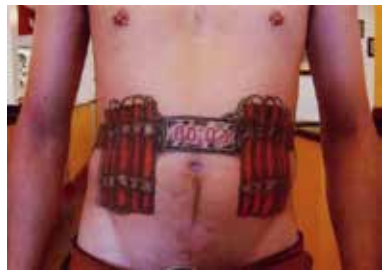
Self-styled Odessa Local funster JJ Goofball always gets a rise out of the Airport Security Officers with this eye-catching tatt.