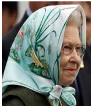
Donald Trump has declared Britain a No-Go nest of Massive Muslims. Even the Queen has been forced to adopt Hijab.