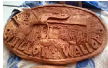
Willow Wallop farm is hosting numerous migrants over the Christmas Period. They hale from as far afield as Abergavenny

And it's not just people who are migrating. In today's globalised world major corporations have moved to the sun and fun of places like the Cayman