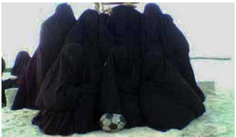
Brecon Burqettes Team - (well at least its better than frog onesies)

The Brecon Burqettes are scheduled to lay the Odessa Trumpsters in a Christmas friendly in the Shell-Lube Parking Lot.