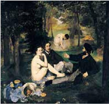
Major world cultural institutions have joined the campaign to correct important art works that are sending the wrong sorts of messages to the viewing public