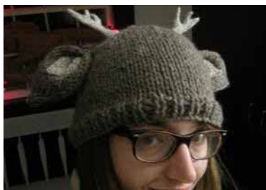
Our Bard in Training

concealed within these pages. Just email us the page and column number and you may be the lucky subscription winner! All of our filters have been set to parameters based on respondents who filled out the controversial 'Personality Tests' conducted by the Odessa Home Hardware. Cybernetic scrutineers have filtered out a redundancy factor of individuals who made multiple submissions in desperate attempt to discover some redeeming alternative personality. We believe that the results reflect liberal minded local humano-centric values in which our community such pride takes. Our news feed robot accesses news platforms from around the world, and produces flawless translations of the most complex dialects, providing our antediluvian reading public with instant sound bites on any unfold events almost before it happens. Find our hidden nugget in these very pages of our Happy Holiday edition and you could win big time!