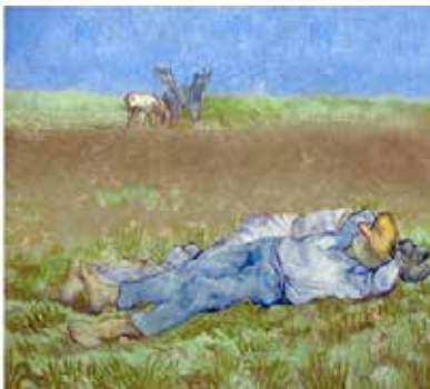
Some of our best loved art needs a radical rethink