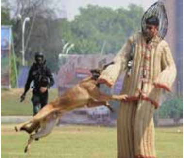
Trained Malinois are always keen to please!

They have won the hearts of millions as they infiltrated terrorist hangouts to terrorise their prey. Breeders around the world have been booked for all existing stock well into the coming year and many have had to resort to surrogate parenthood to fulfil the burgeoning world-wide demand. With eyes located near the top of the head the Malinois boasts 360 degree and 100/20 vision acute to nuance at great distances. Razor sharp bicuspid, bred to achieve a 210 lbs per sq inch cinch, can far outperform other pooches. Yet owners confirm that once you get them trained you are putty in their hands.